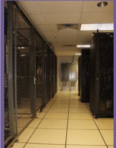
5NINES DATA CENTER