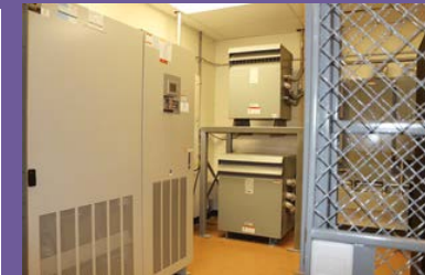
UNINTERRUPTIBLE POWER SUPPLY (UPS)