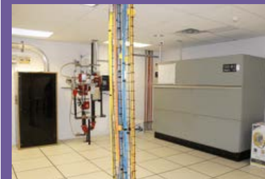
FIRE SUPPRESSION AND AN HVAC SYSTEM